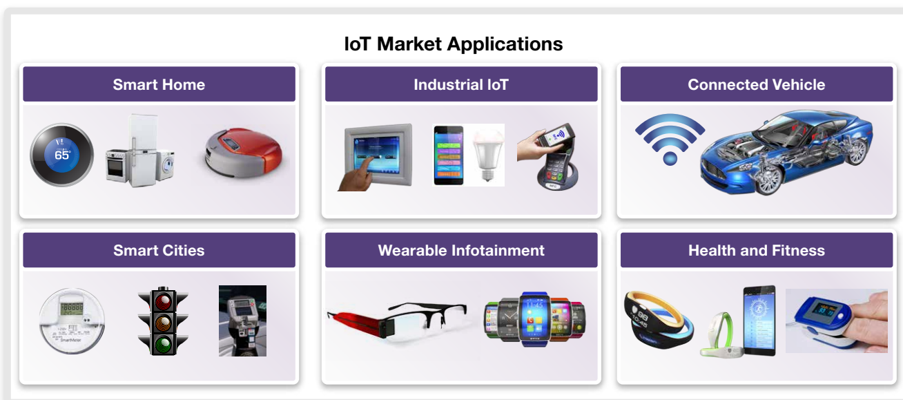
Figure 1: Example of Key IoT Applications for Edge Devices